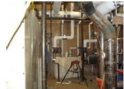
Boiler Room (View 2)