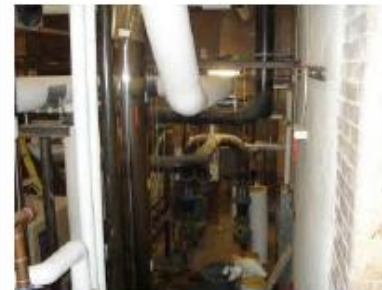
Boiler Room (View 1)